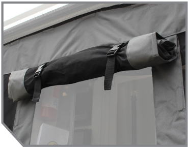
ROLL UP DOOR WITH NYLON BUCKLES AND STRAPS