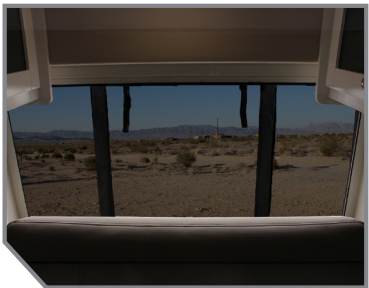
REDUCE TEMPERATURES AND REDUCE LIGHT INTRUSION