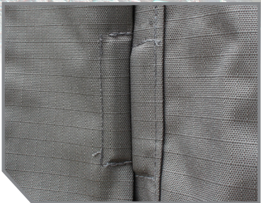
SECURE DOORS WITH MAGNETS

Easy self-install magnetic flyscreens making it easy to enter and exit the van while keeping insects out. With magnets sewn around all edges just simply connect onto the vehicle with ease. To uninstall, just pull off, fold up, and pop into the storage bag. No fixed installation or tools are required.