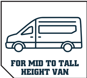
FOR MID TO TALL HEIGHT VAN