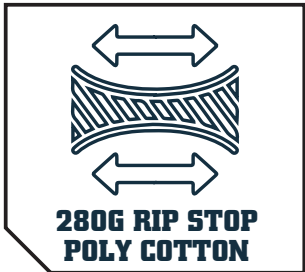
280G RIP STOP POLY COTTON